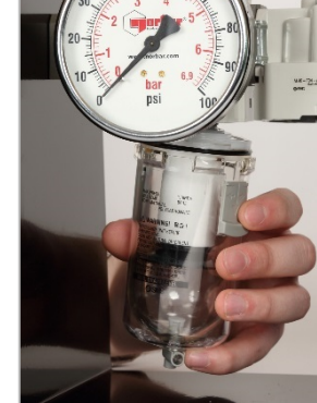
FIGURE 9 - Replacing the Filter Element