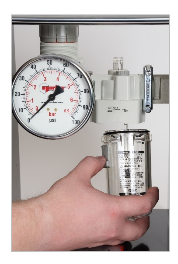
FIGURE 6 – Lubricator Bowl Replacement