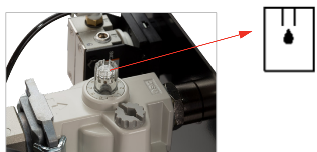
FIGURE 5 - Lubricator Flow

Turn sight glass counter clockwise to increase oil flow.