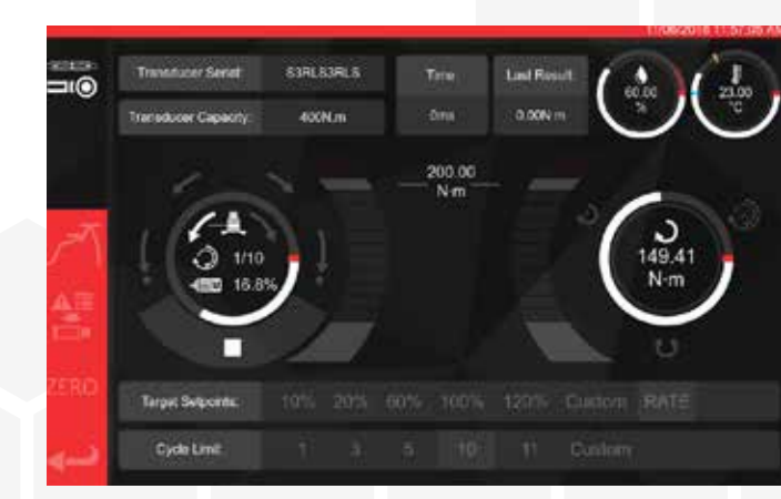
Tool cycling and adjustment whilst in operation