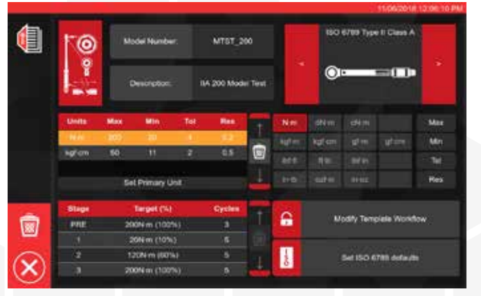
Tool template editor