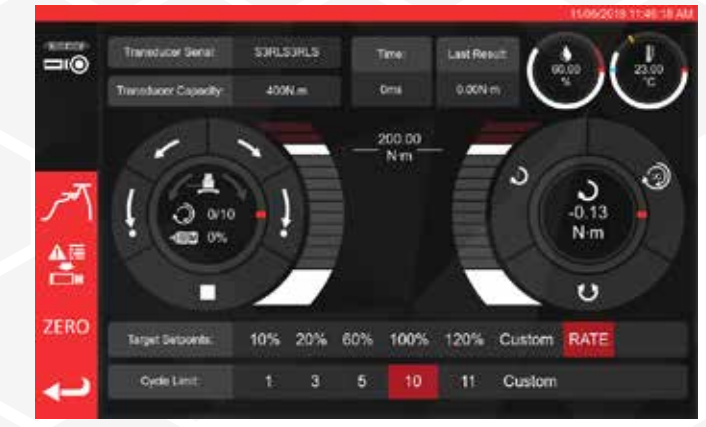
Tool cycling and adjustment