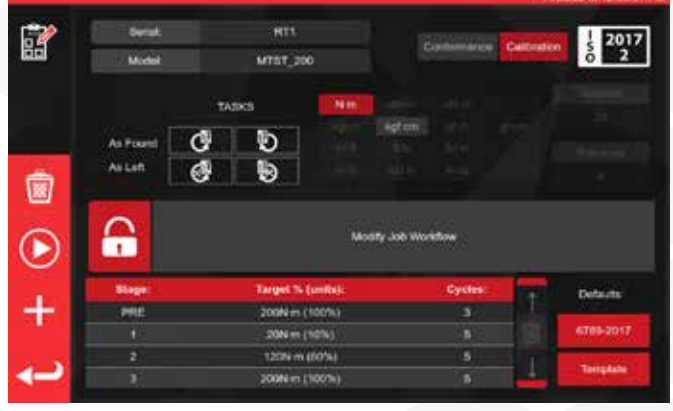
Calibration job booking / editor