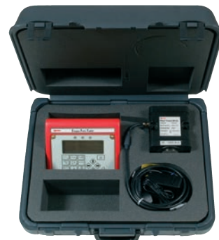
TTT in standard carry case. STB1000 Transducer also shown.