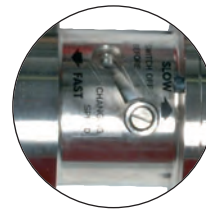
Manual 2 Speed