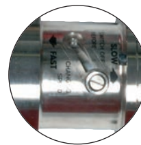
Manual 2 Speed