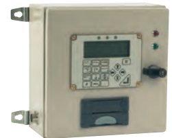
Tool controller in wall box for external control versions. Part No. 60244 without printer or 60254 with printer. Cable for use with PTM tools, Part No. 61127.600.