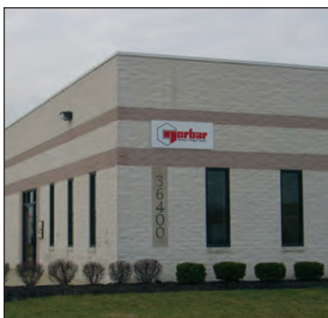
Norbar Willoughby, Ohio