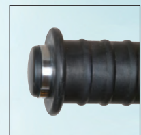
'P' Type - Sealed Adjustment

† Length with adjusting nut set to minimum torque.