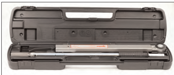
Split Industrial in Box.