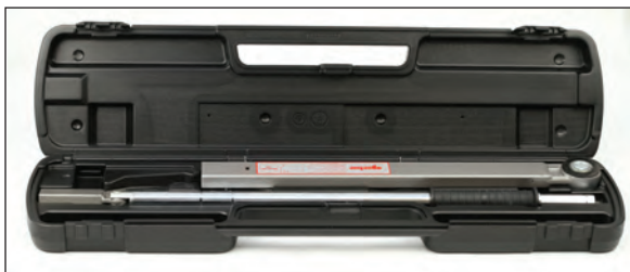
Split Industrial in Box.