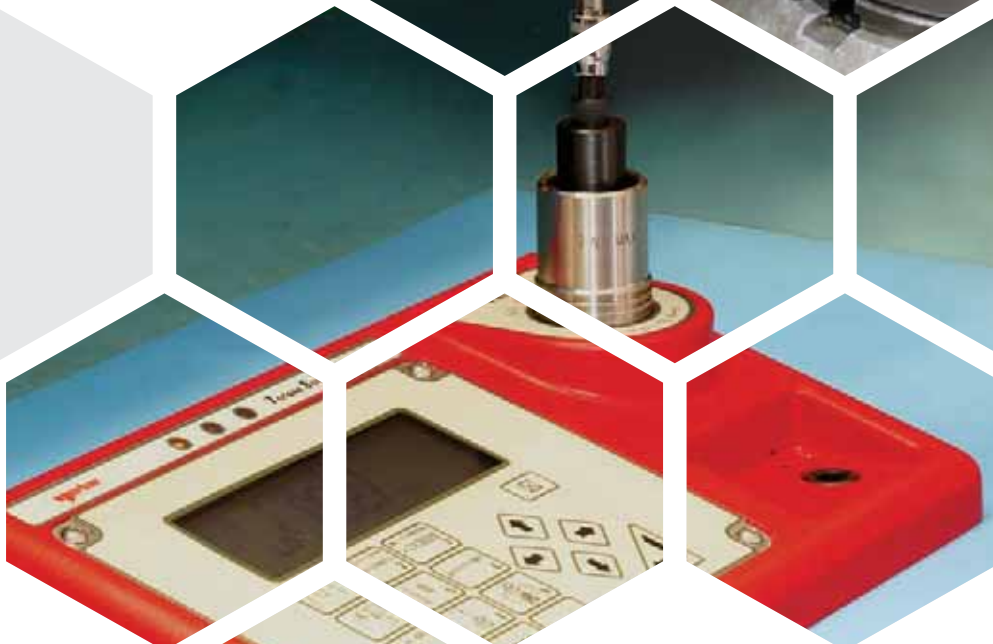
Torque Screwdriver Tester (TST)