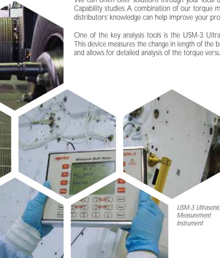
USM-3 Ultrasonic Measurement Instrument

One of the key analysis tools is the USM-3 Ultrasonic Measurement Instrument. This device measures the change in length of the bolt due to the tightening process and allows for detailed analysis of the torque versus tension relationship.