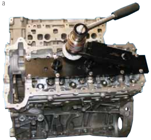
Handtorque multiplier fitted with torque bar adaptor, special torque reaction arm and angle gauge assembly