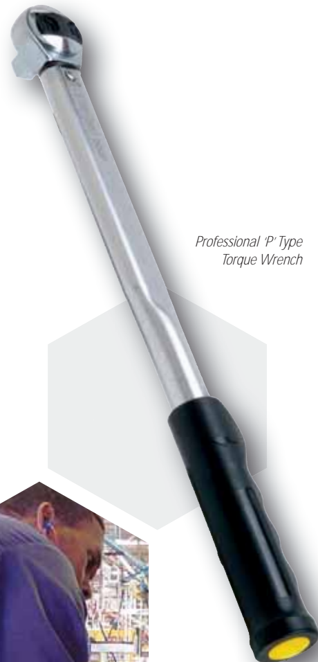
Professional 'P' Type Torque Wrench

Norbar distributors around the world are chosen for their ability to give you local support when you need it. Within our family of distributors we share applications and can often recommend solutions that have been tried and tested elsewhere.