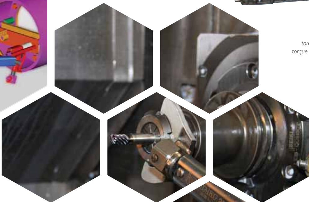
Special fitting for torque tightening of tool collets. Under tightening can result in the collet not holding the tool whereas over tightening can cause damage to the collet.