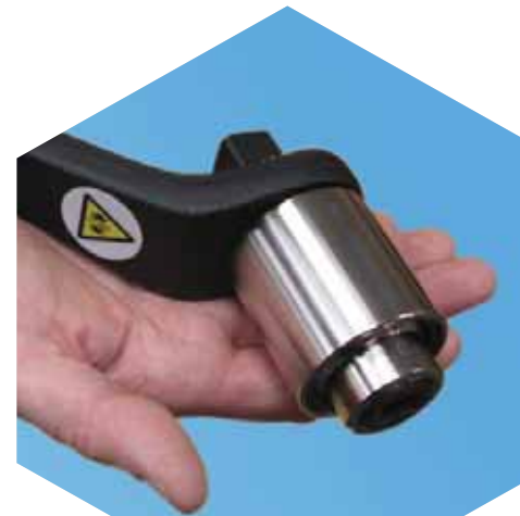
HT-52 1000 N.m Torque Multiplier

To keep major items of plant such as power presses in top condition it is vital to carry out preventive maintenance. This often involves the loosening and tightening of large or awkward fasteners. Norbar specialise in small powerful torque multipliers that make short work of these difficult fasteners. With a Norbar Handtorque™ in your maintenance toolkit and the support of your local distributor for the design of specialised torque reaction arms, you can tackle those difficult jobs in less time and with more confidence.