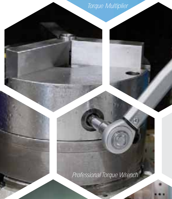
Professional Torque Wrench