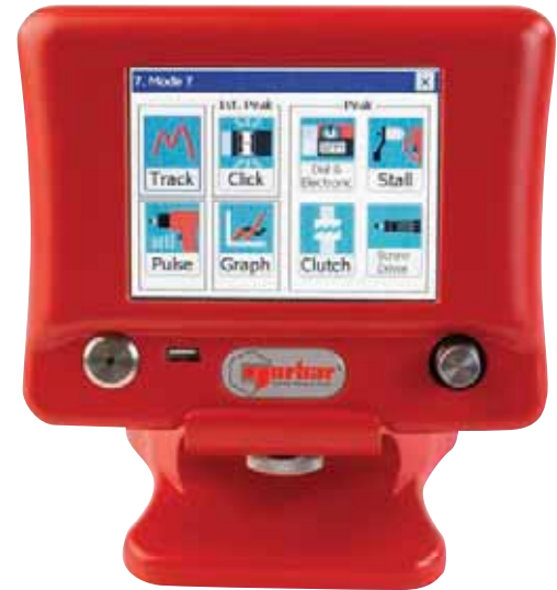
T-Box™ torque and angle measuring instrument

T-Box™ is the latest Norbar measuring instrument, with its TDMS software, designed to store trend data and assist you in setting appropriate recalibration or maintenance intervals.