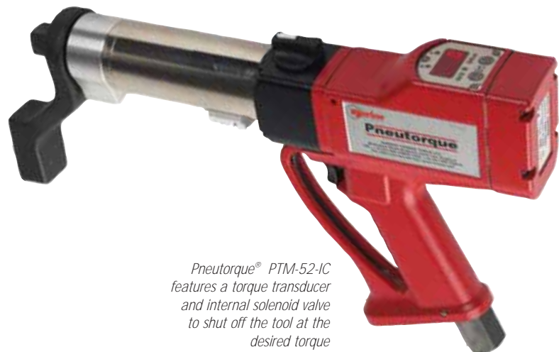
Pneutorque® PTM-52-IC features a torque transducer and internal solenoid valve to shut off the tool at the desired torque