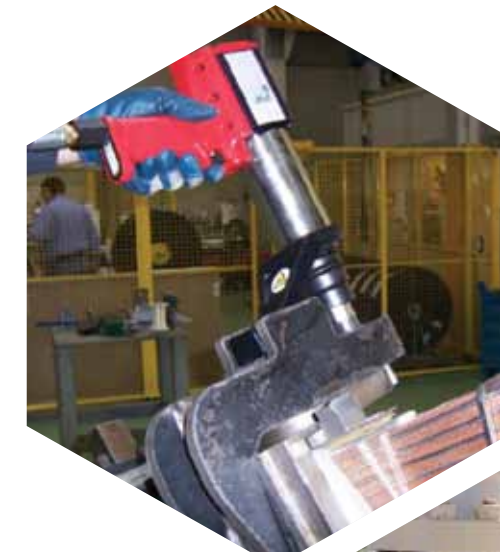
Pneutorque® PT72 used to precision bend copper bar prior to its use in generator sets