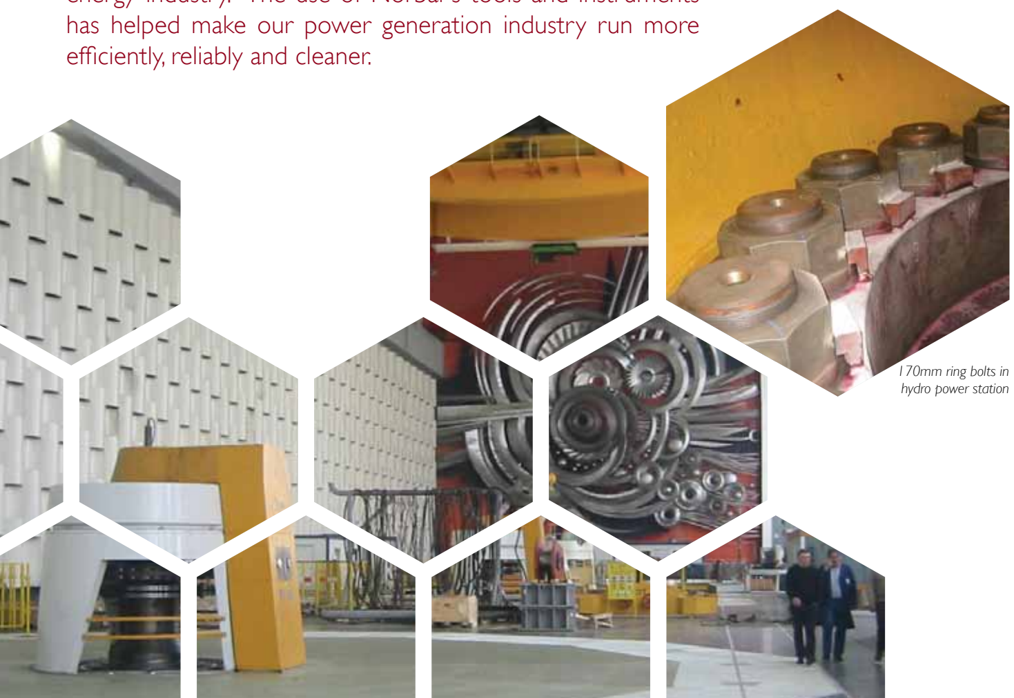
170mm ring bolts in hydro power station