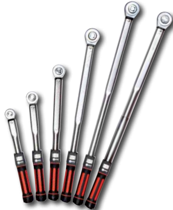
Professional torque wrench range

Throughout Norbar's 70 year history we have been closely involved with the power generation industry: from coal fuelled plant through to highly safety critical areas of nuclear plant and, more recently, extensive involvement in the wind energy industry. The use of Norbar's tools and instruments has helped make our power generation industry run more efficiently, reliably and cleaner.