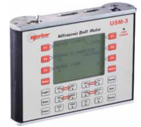
USM-3 Ultrasonic Bolt Meter

Norbar's USM-3 is one of the most powerful tools ever to be made available to engineers concerned with bolted joint integrity. The USM-3 uses ultrasound to measure the change in length of bolts during and/or after the tightening process. Unlike indirect methods of tension control such as torque or torque and angle, ultrasonic measurement of bolt load or elongation bypasses the problems of friction and other variables resulting in significantly more accurate bolt tension. Issues such as vibration loosening, bolt yielding, embedment relaxation, and many others can be identified and addressed prior to failure; likewise, verification of residual stud tension after using hydraulic or mechanical tensioning systems or post-heating provides data that can be uploaded to a computer, saved as an Excel spreadsheet and printed for hardcopy documentation. The USM-3 has been laboratory and field proven to be the most accurate, reliable and cost effective solution to bolting failures which could lead to leaks, capital equipment damage and risks to workers.