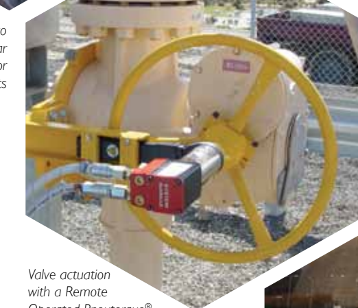
Valve actuation with a Remote Operated Pneutorque®