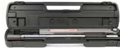
Split torque wrenches up to 2000 N-m, ideal for carrying in maintenance vehicles

Another innovation in the torque wrench range is the introduction of \frac{3}{8} " and \frac{1}{2} " drive, 1000 Volt insulated torque wrenches, tested to IEC 60900:2004 and suitable for live line working (only where the operator is qualified to do so).