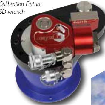
7000 N-m Hydraulic Torque wrench Calibration Fixture with Norbar NSD wrench

All transducers up to 108,500 N-m are supplied as standard with a UKAS accredited calibration certificate from Norbar's in-house laboratory. Re-calibration and service of torque transducers and instruments can be performed at Norbar's own locations in UK, Australia, USA, Singapore and China. Other locations in the world are covered by a family of factory trained and equipped distributors.