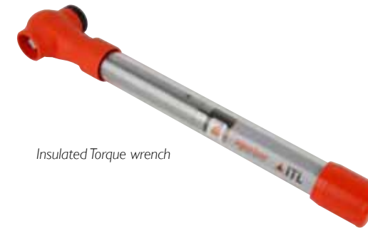
Insulated Torque wrench