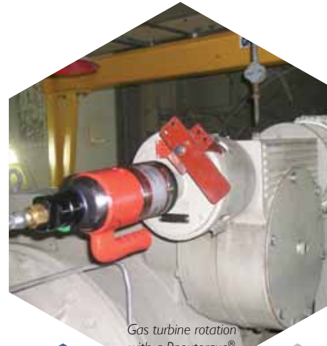
Gas turbine rotation with a Pneutorque®